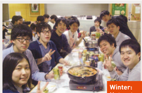
Winter: Hot-pot party

For the cold winter season, nothing could be better than hot pots! Lab members are divided into several teams, who prepare their own hot pots – seasoned with soy sauce, miso (bean paste) or salt – and vie for tastiness. Could your team cook a tasty hot pot? Some say victory depends on the leadership of your "pot magistrate".