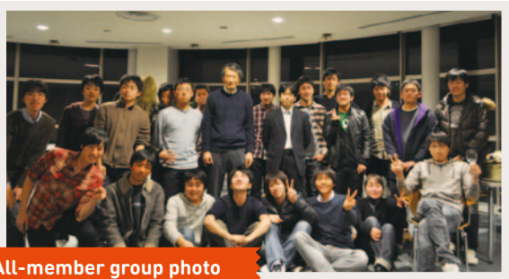
All-member group photo