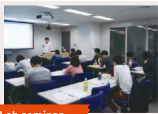
Lab seminar (study session)