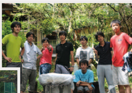
Summer: Study camp

Every summer we visit the seaside or mountains for an overnight stay, where we enjoy sports, barbecue, camping, etc. This event serves as a good opportunity for the lab members to further solidify mutual bonds.