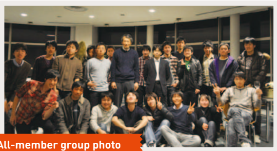
All-member group photo