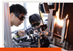
Engaging in research

Our lab holds seminars (study sessions) twice a week. A student in charge of a particular seminar serves as an instructor, lecturing on other students' research subject matters related the session's theme. Thus, all participants develop active discussions.