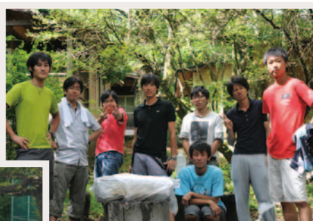
Summer: Study camp

Every summer we visit the seaside or mountains for an overnight stay, where we enjoy sports, barbecue, camping, etc. This event serves as a good opportunity for the lab members to further solidify mutual bonds.