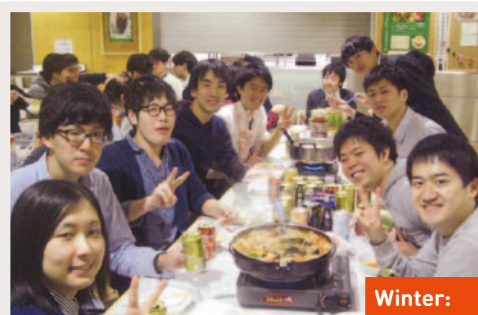
Winter: Hot-pot party

For the cold winter season, nothing could be better than hot pots! Lab members are divided into several teams, who prepare their own hot pots – seasoned with soy sauce, miso (bean paste) or salt – and vie for tastiness. Could your team cook a tasty hot pot? Some say victory depends on the leadership of your "pot magistrate".