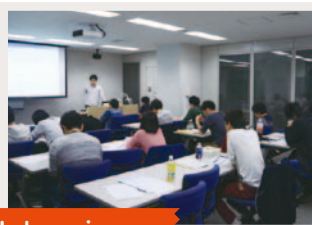
Lab seminar (study session)