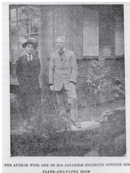
(Fig. 3, The New Japan , p. 25)

The room was about 12 feet square: a wooden structure with paper windows ( shoji ); sliding doors ( amado ); a floor of woven cane matting ( tatami ) filled with cotton waste, clean and resilient, pleasant for all waking and sleeping activities; cupboards with pictured sliding doors; a tokonoma (recess) for a kakemono (hanging picture) and a piece of craftsmanship. The roof of my home was tiled with small wooden “tiles.” It was entered from the outside by a twisted row of stepping stones along a “garden” that grew here and there a shrub and tallish trees. There were three stone steps from ground to verandah. From the first of these I looked across uncountable house-roofs on one side of the city. On the foreground the watch-tower of a fire station clanged out the