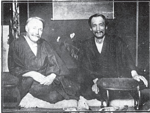
A JAPANESE POET'S SMILE (RIGHT)—PAGE. 36