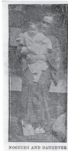
Fig 4. ( The New Japan , p. 205)